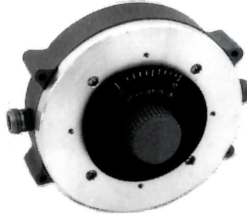
Panel Mount P Option Form 0-1034 **