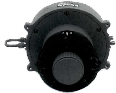
Standard Form 0-1030